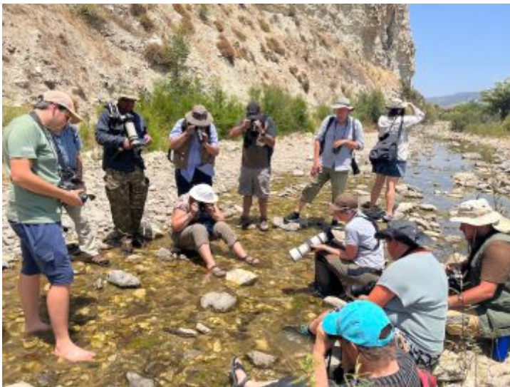
Delegates on the post-congress field trip, examining a recently emerged Onychogomphus forcipatus (Small Pincertail)

Some social events were organised, including a welcome cocktail on the Sunday evening before the start of the formal proceedings and a wine tasting presented by Tsangarides Winery, when some wines from indigenous grapes were sampled. The congress concluded with a relaxed dinner on Friday 30th June around the university swimming pool.