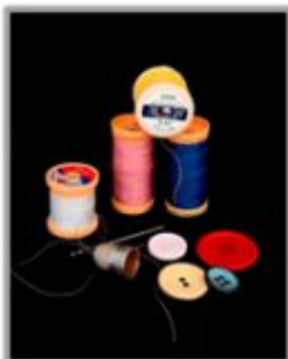
A Stitch in Time