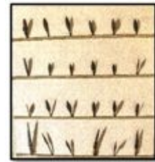
Ancient Arrow heads

Our field trip to the deserted village of Foinikas would not have been complete without the now traditional group photo ----->