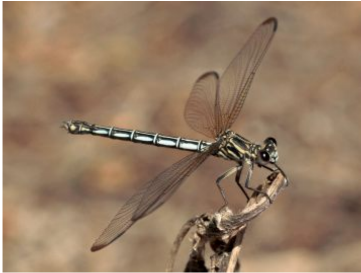
Epallage fatime (Odalisque) (David & Ros Sparrow)