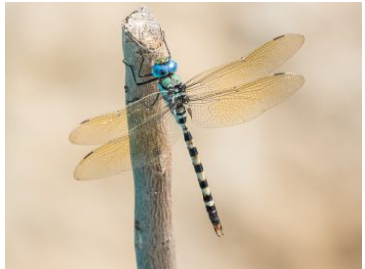
Anax immaculifrons (Magnificent Emperor) (Dave Walker)

For several species that have an African distribution, Cyprus is at the northern extremity of their range, and for some Asian species at the north-western geographical extremity, so many delegates had not seen these species before. The trips included sites in the Diarizos Valley, those around the Gabion Dam near Delikipos, an agricultural pond in Eptagoneia, Lemba park, Xeros vally and the soakaways below Agia Varvara. Finding mobile critters in the wild is notoriously hit-and-miss, but luck was on our side and we were able to see 27 species, including all those particularly targeted.