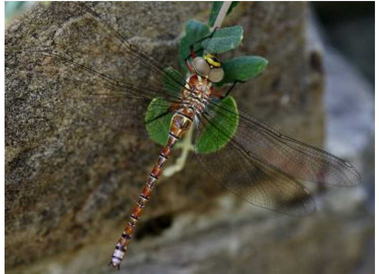
Caliaeschna microstigma (Eastern Spectre) (Klaus Siedle)

For several species that have an African distribution, Cyprus is at the northern extremity of their range, and for some Asian species at the north-western geographical extremity, so many delegates had not seen these species before. The trips included sites in the Diarizos Valley, those around the Gabion Dam near Delikipos, an agricultural pond in Eptagoneia, Lemba park, Xeros vally and the soakaways below Agia Varvara. Finding mobile critters in the wild is notoriously hit-and-miss, but luck was on our side and we were able to see 27 species, including all those particularly targeted.