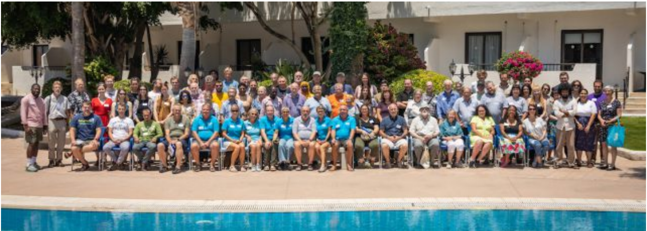
ICO 2023 Group Photo