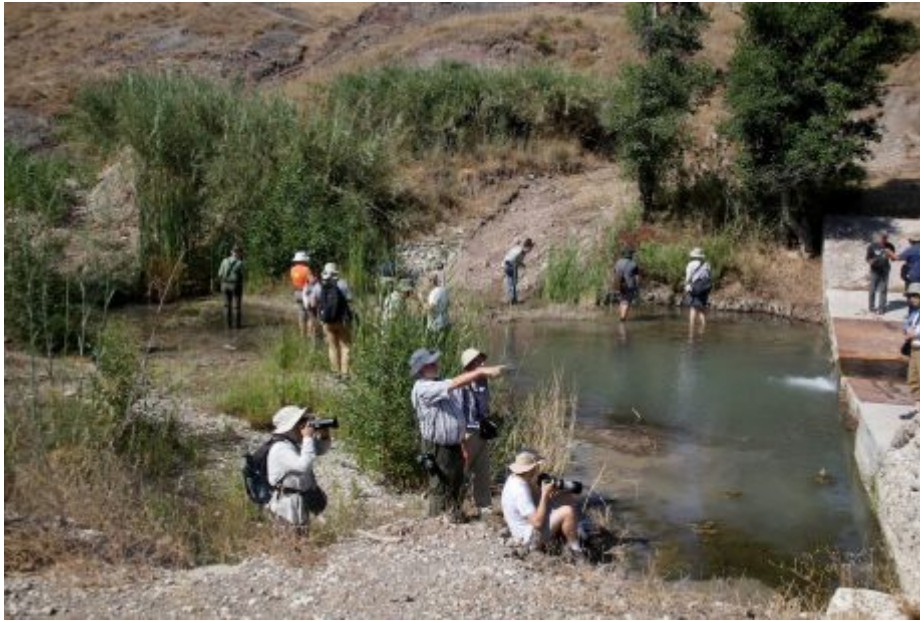
ICO 2023: delegates at the Iron Bridge on the Ezousa river below Episkopi during the mid-congress field trip

Some social events were organised, including a welcome cocktail on the Sunday evening before the start of the formal proceedings and a wine tasting presented by Tsangarides Winery, when some wines from indigenous grapes were sampled. The congress concluded with a relaxed dinner on Friday 30th June around the university swimming pool.